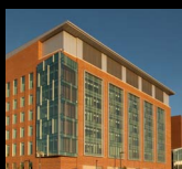
School of Pharmacy