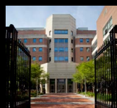
School of Nursing