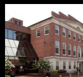
School of Social Work