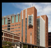
School of Dentistry