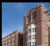
Carey School of Law