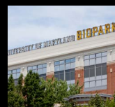
University of Maryland BioPark