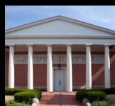
School of Medicine, Davidge Hall