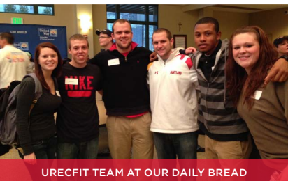
URECFIT TEAM AT OUR DAILY BREAD