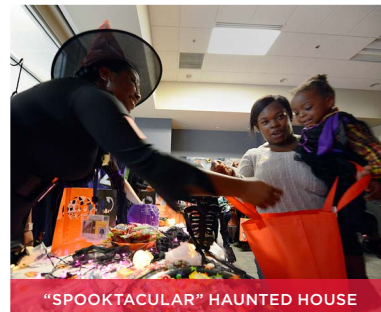
"SPOOKTACULAR" HAUNTED HOUSE