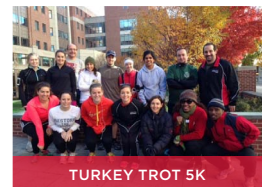
TURKEY TROT 5K