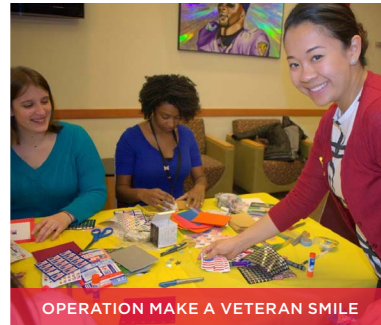
OPERATION MAKE A VETERAN SMILE