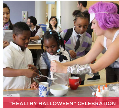
"HEALTHY HALLOWEEN" CELEBRATION