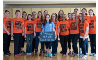
THE DENTAL SCHOOL'S AAWD TRIATHLON TEAM

The student chapter of the American Association of Women Dentists (AAWD) raised $745 for the Ulman Cancer Fund for Young Adults through the fourth annual UMB AAWD Indoor Triathlon, which the chapter hosted in March.