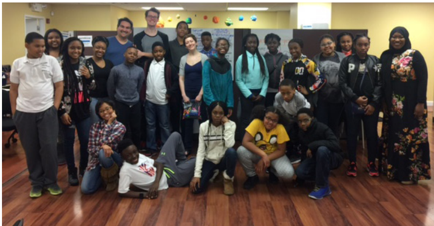
SMILES ABOUND AFTER “BULLY BUSTERS” ANTI-BULLYING SESSION WITH KAISER PERMANENTE.