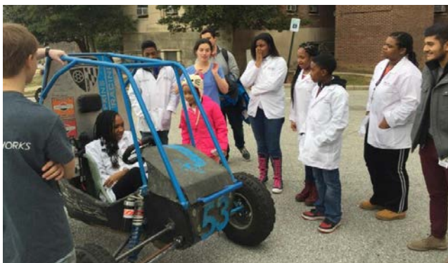
VISITING HOPKINS’ MECHANICAL ENGINEERING LABS PROVED A FUN AND INFORMATIVE EXPERIENCE FOR THE UMB CURE SCHOLARS.