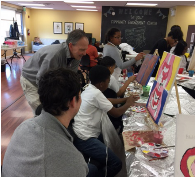
SCHOLARS USE ART SKILLS IN MEDICAL CONTEXT AT COLOUR STROKES PAINT PARTY.

CURE Corner provides noteworthy updates from UMB's CURE Scholars Program, a pipeline initiative that prepares West Baltimore children for health and research careers through hands-on workshops, lab experiences, and mentorship. UMB's CURE Scholars are the youngest ever to participate in the National Cancer Institute's Continuing Umbrella of Research Experiences (CURE) national program.