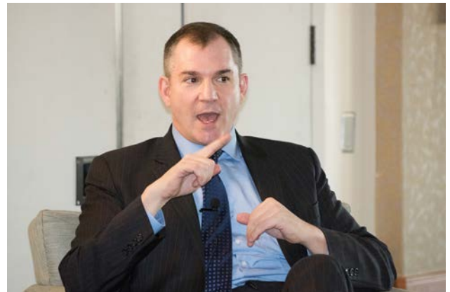
THE TIMES' FIRST OPENLY GAY OP-ED COLUMNIST, BRUNI SAID THE "OUTLOOK IS BLEAK" FOR VARIOUS SOCIAL JUSTICE MOVEMENTS THAT WERE GAINING GROUND UNDER THE OBAMA ADMINISTRATION.

Calling Trump's Cabinet picks "a big mess from various different angles," Bruni said Americans find Trump to be offensive in his comportment but support some of the things he is advocating. Bruni also said politicians from unconventional backgrounds could be a wave of the future. "We live in a culture that is increasingly celebrity-driven. In some cases it could bring us bizarre candidates and in some cases inspiring candidates."