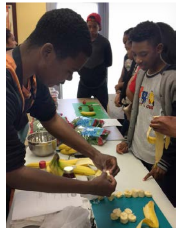
CREATING NUTRITIOUS LUNCHES WITH KINETIC KITCHEN.