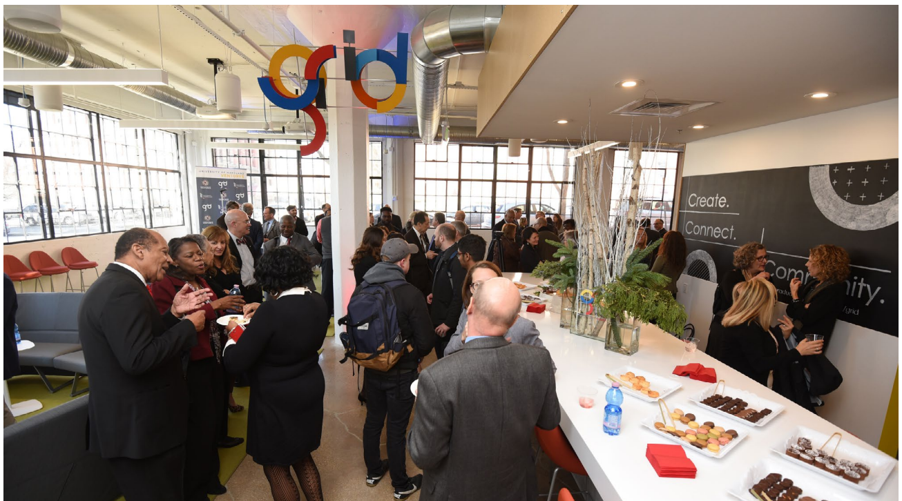
LAUNCH OF UM VENTURES 2.0 AND OPENING OF THE GRID — LION BROTHERS BUILDING, DECEMBER 2017