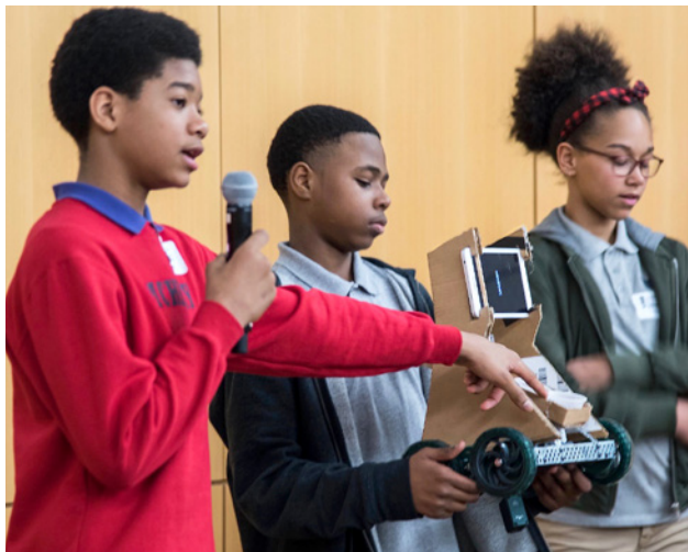
THREE JAMES MCHENRY STUDENTS DISCUSS THE BENEFITS OF THEIR MEDICATION-DISPENSING SERVICE-BOT AT THE SCHOOL OF PHARMACY.

Students from James McHenry Elementary/Middle School paid a visit to the University of Maryland, Baltimore (UMB) on Feb. 22 for a unique learning experience. The group of 30 sixth- and seventh-graders got the chance to earn a life-saving certification with Stop the Bleed training and then present their own life-saving invention to a room of people from the School of Pharmacy (SOP)