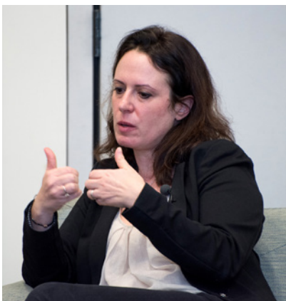
HABERMAN: TRUMP “ACTUALLY HATES ONE-ON-ONE PERSONAL CONFLICT. SO THE KINDS OF THINGS HE SAYS ABOUT [MEDIA] ON TWITTER ... HE RARELY WILL SAY THAT ONE-ON-ONE.”