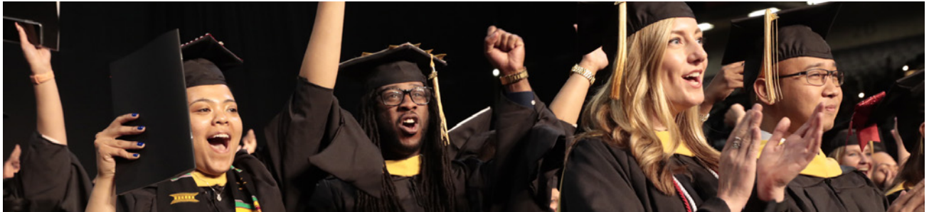
THE CLASS OF 2019 WON'T HAVE TO WAIT UNTIL THE END OF THE TWO-DAY COMMENCEMENT SCHEDULE TO CELEBRATE AT ROYAL FARMS ARENA.

As the calendar turns to April, it means the University of Maryland, Baltimore's (UMB) biggest day of the year is just around the corner: Commencement 2019. And this year features the dawn of a new era, with the ceremony at Royal Farms Arena moving from its traditional Friday afternoon time to Thursday morning. The event will run from 9 to 11 a.m. on May 16.