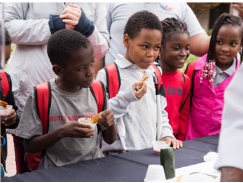
SOME OF THE ELEMENTARY SCHOOL STUDENTS AT PLAZA PARK TASTE-TEST THE ZUCCHINI FRIES ...

The annual program is organized through a partnership between UMB's Office of Community Engagement (OCE) and the University of Maryland Medical Center (UMMC). The goal of the program is to show Baltimore City children how to be active and healthy through a hands-on learning program that introduces them to new fresh fruits and vegetables over the course of several weeks.