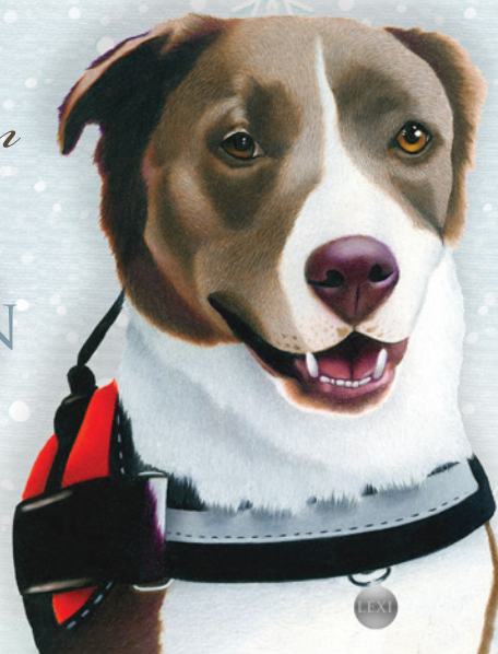
ILLUSTRATION BY JACOB KOZAK, AGE 17

LAURELS ARE SUBMITTED BY THE COMMUNICATIONS DEPARTMENTS OF THE SCHOOLS AS WELL AS BY REPRESENTATIVES IN VARIOUS UNIVERSITYWIDE OFFICES. THE OFFICE OF THE PRESIDENT IS NOT RESPONSIBLE FOR ERRORS IN THESE SELF-SUBMITTED LAURELS.