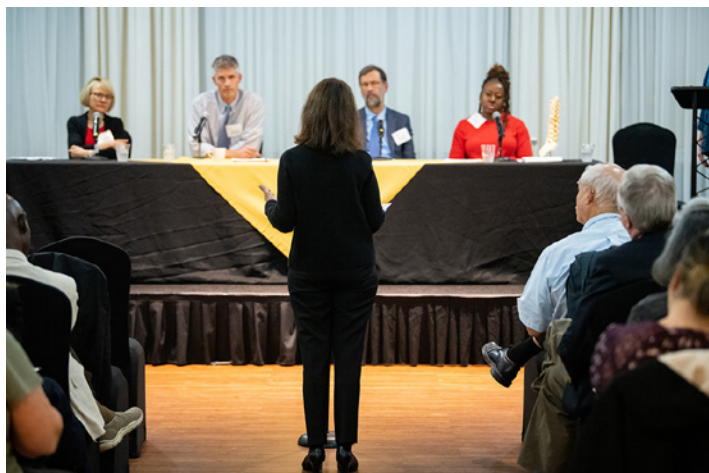
... MEMBERS OF THE AUDIENCE AT PADONIA PARK CLUB ASKED THEM QUESTIONS SEEKING FURTHER INFORMATION ABOUT OPIOID ABUSE AND MORE.