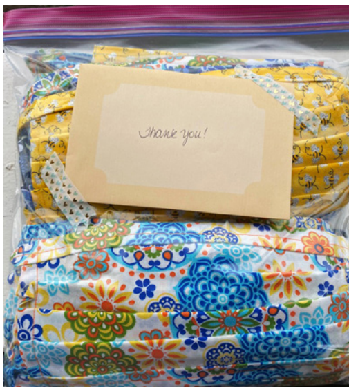
ONE BAG OF HOMEMADE MASKS INCLUDED A THANK YOU NOTE FOR THE HOSPITAL STAFF.