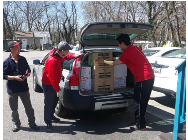
STUDENTS LOAD SUPPLIES INTO A CAR IN PREPARATION FOR DELIVERY TO LOCAL HEALTH CARE WORKERS.