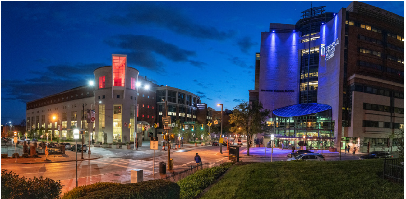
THE HEALTH SCIENCES AND HUMAN SERVICES LIBRARY GLOWS IN RED AND THE UNIVERSITY OF MARYLAND MEDICAL CENTER LIGHTS UP IN BLUE TO SHOW APPRECIATION FOR ESSENTIAL WORKERS.