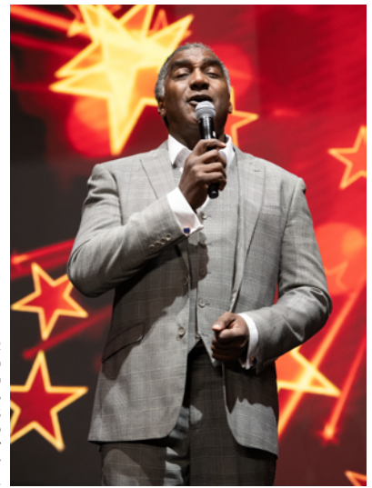
BROADWAY STAR NORM LEWIS SANG FOUR SONGS DURING THE FOUNDERS WEEK AWARDS RECOGNITION AND RECEPTION EVENT OCT. 19 AT THE NEW M&T BANK EXCHANGE.

Read about the Founders Week Student Cookout and Staff Luncheon on pages 11-12.